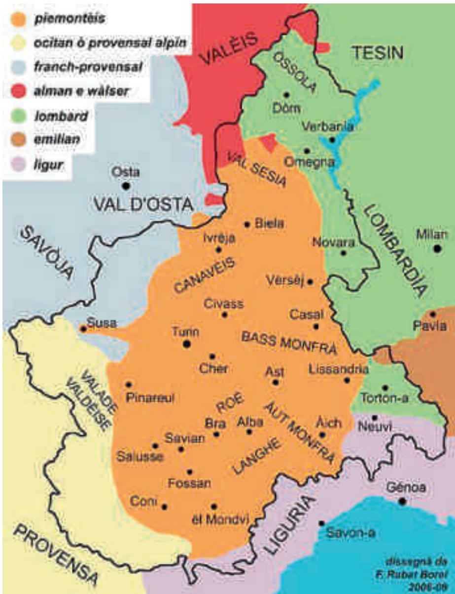
Map 1: The languages of Piedmont and neighbouring areas